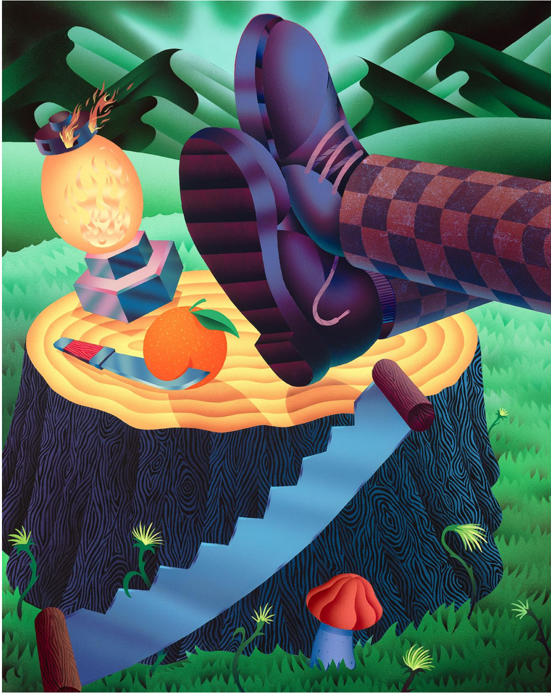
Michael Polakowski Kick Your Feet Up, 2023 Acrylic on canvas, 30 x 24"