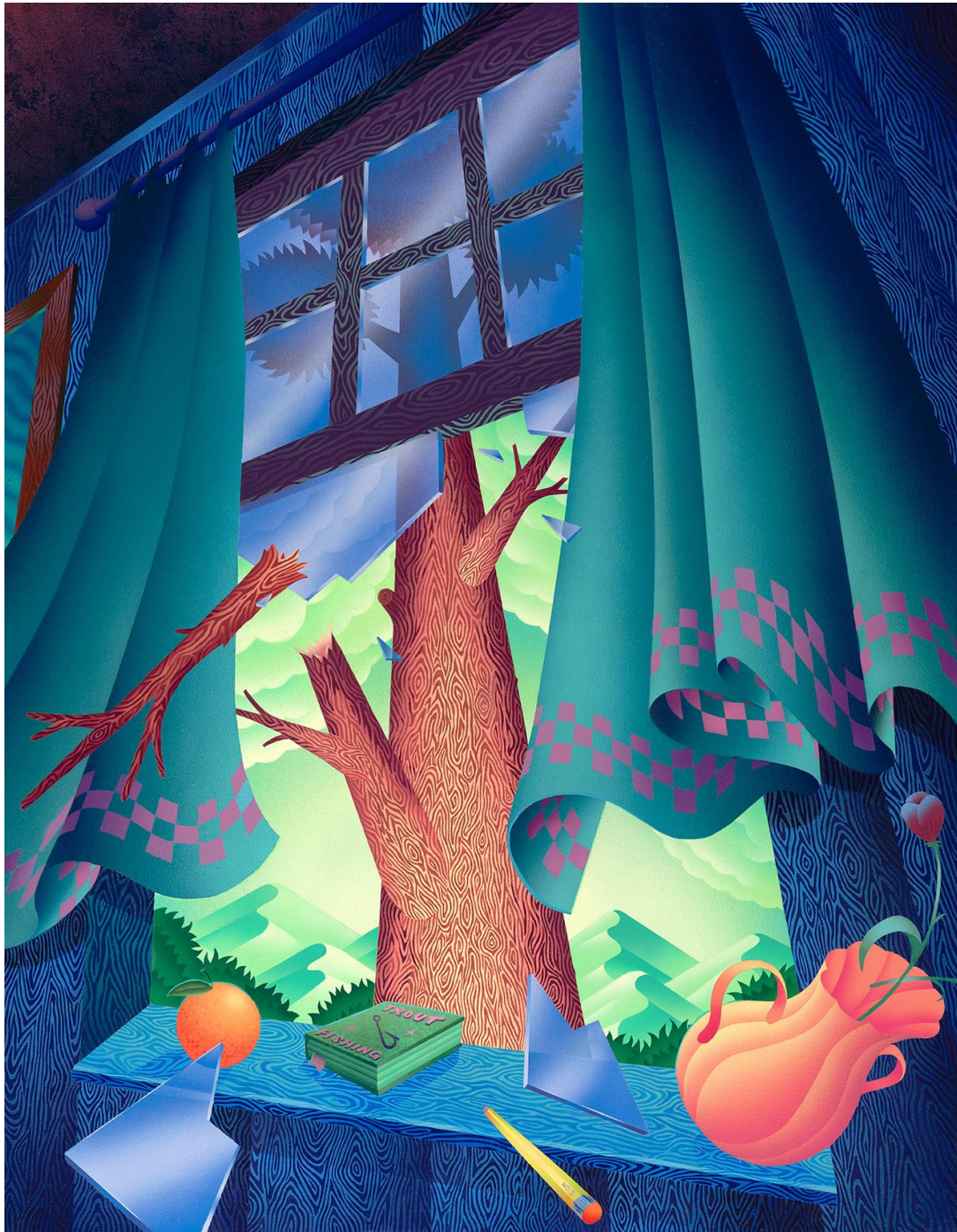
Michael Polakowski Minor Inconvenience , 2023 Acrylic on canvas, 46 x 36"