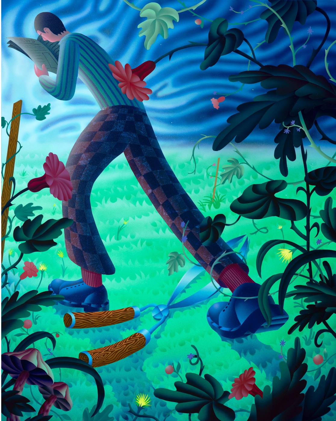
Michael Polakowski I'll Be Back in 5, 2023 Acrylic on canvas, 30 x 24"