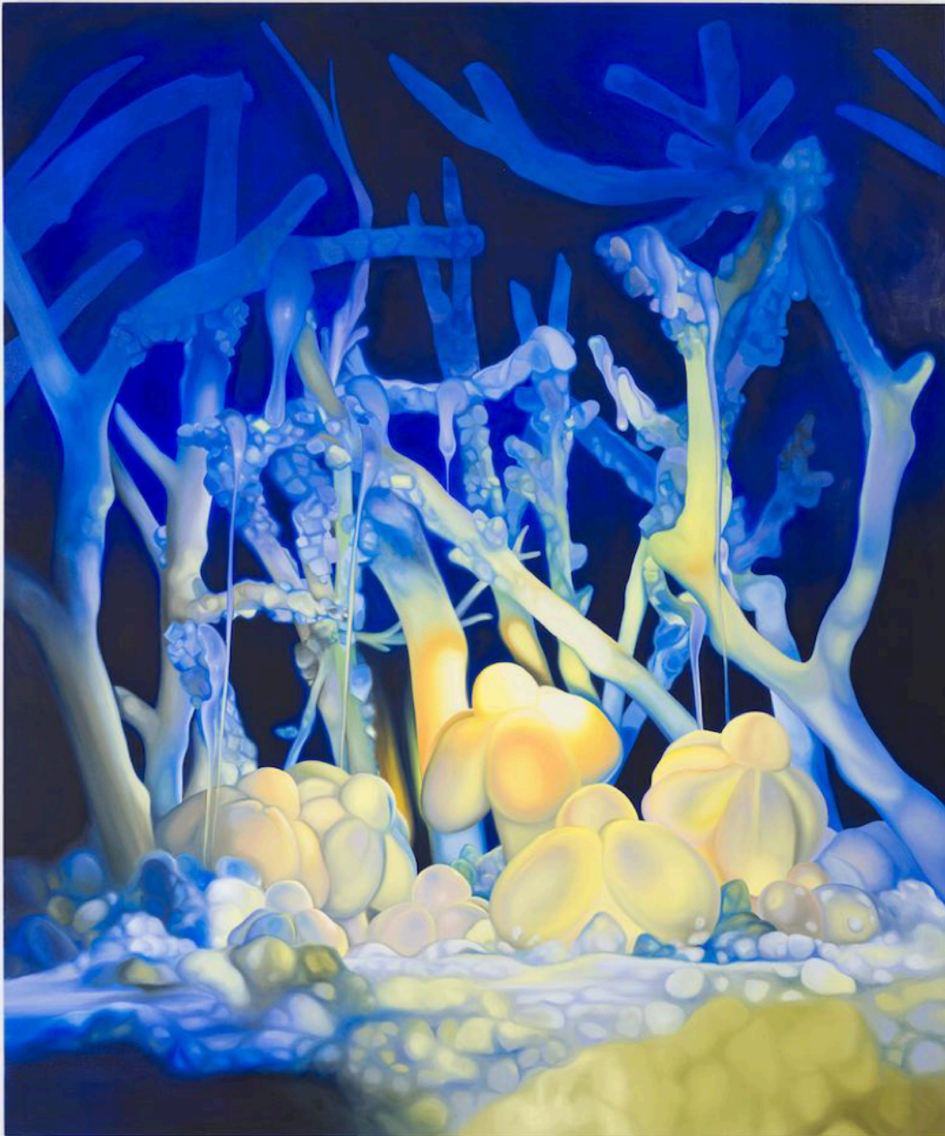
Hannah Antalek, Seminal Landing, 2023, oil on canvas, 72 x 60 inches