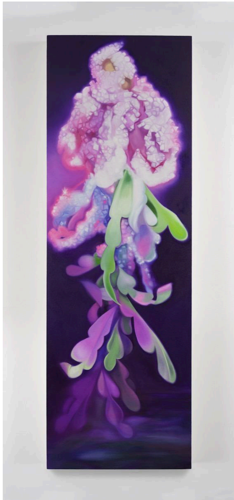
Hannah Antalek, Final Form, 2023, oil on canvas, 60 x 22 inches

Final Form , stretching five feet high, might be the notional personification of a daisy dupe, portrayed as if it were a starlet. The soft, fluorescent halo recalls color-retouched photos of the 1930s, while the digital prismatic hues are fiercely contemporary. Neon pinks dance amid deep manganese violet around mysterious diamond-like forms that appeared in Seminal Landing . In both